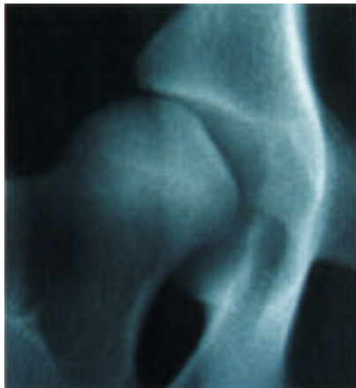
Right hip in close up. Minor degree of hip dysplasia (single hip score:10)

In simplistic terms the genetic code is rather like the architect's building blue prints and, the environment, the builders and their materials. In HD the architect gets things wrong to a greater or lesser extent but the builders have the greater influence on how things look and function in the final analysis.