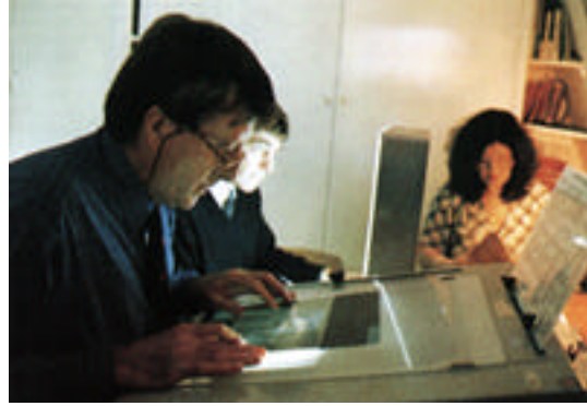
Two members of the BVA/KC Hip Dysplasia panel meet weekly to examine radiographs submitted under the scheme